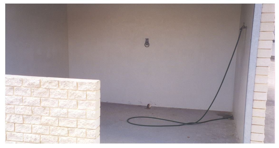
Roofed wash-down bay with drainage

Contaminated wastewater such as wash-down wastewater, should be contained and managed. Wash-down wastewater typically contains hair, urine, sweat, manure, dirt, cleansers, woodwaste or straw.