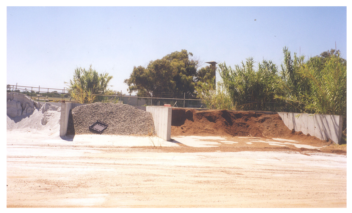
Contained storage of woodchips and manure on an impermeable surface